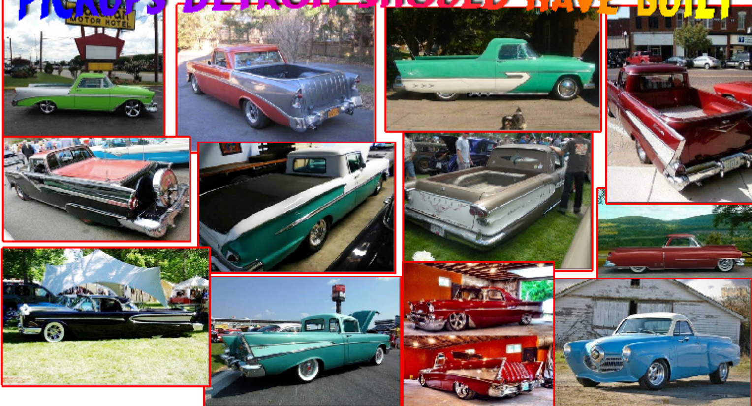
Pickup Photos from Walter B. Ready