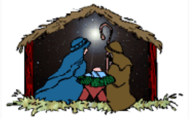
Our Lord and Savior Jesus Christ Was Born

All Club Members are encouraged to attend the Board Meetings !!! Board Meetings For 2015 are the 4th Monday of the Month except December December 28, 2015 Board Meeting Location: Sunshine Service Building, 9980 Santa Fe Dr., Sun City, AZ. (North of Grand Ave., & West of 99th Ave.) Meetings start at 2:00 P.M. !!!