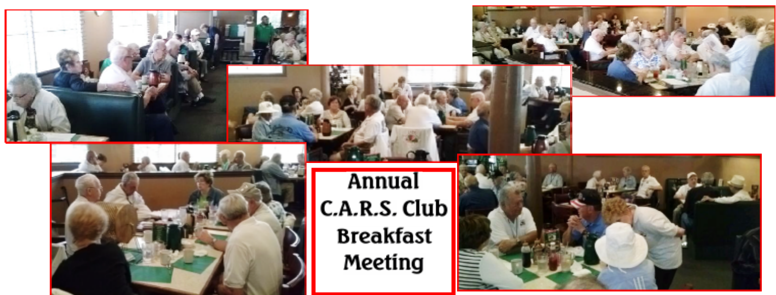
Annual C.A.R.S. Club Breakfast Meeting